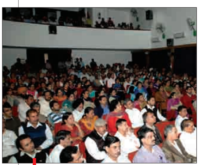
Participants at GFAS workshop for DDOs

cessfully deployed for all departments of Chandigarh Administration wef April 2010 for Tenders above 10 lakhs. It has been widely acclaimed and is now implemented for tenders of all values. Efficient use of technology has been showcased in this application to ensure safety and security. Non-discrimination among bidders, access of tender documents by any bidder & bid submission from their place of convenience are the factors for keen acceptance of the solution. It has also promoted open competition. NIC Chennai is rendering much needed support for its successful implementation. In the current financial year more than 4100 tenders amounting to over 1000 crores have been processed.