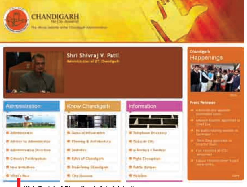
Web Portal of Chandigarh Administration

IC Chandigarh UT Unit was setup in 1990 in the office of